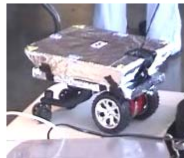
Mars Challenge Vehicle from 3/4/06

EDTE 437 – Student Performance Assessment EDTE 440 – Integrating Math and Science in Occupational and Technology Education EDTE 482 – Core Technologies I EDTE 484 – Information Systems I EDTE 488D – Coordination of Work-Based Learning Programs EDTE 499 – Research and Experimentation