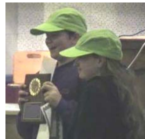
Winners of the MagLev competition – Pine Grove Middle School