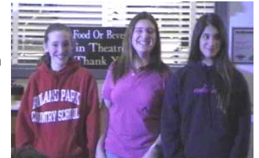
Students from Roland Park that competed in the MagLev middle school Engineering Challenge held at the Baltimore Museum of Industry on Sat. March 4, 2006